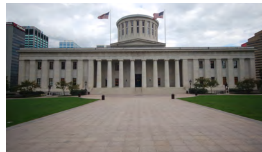
Ohio Statehouse in Columbus, OH