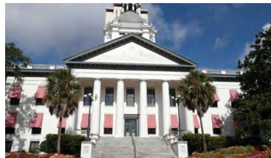
Historical Capitol Building, Tallahassee, Florida